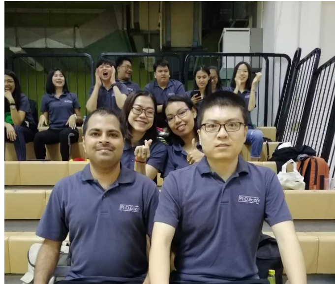
Current students video clips (2)